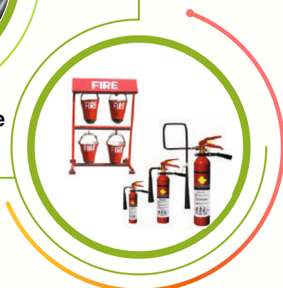
Fire Extinguisher Fire Buckets