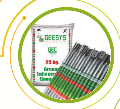
Earthing Electrode with Mineral