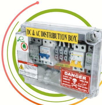
DC & AC Distribution Box