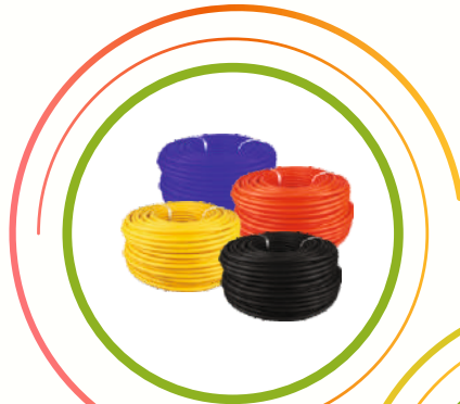
Solar DC/AC Cable