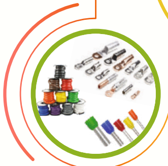
GI Copper Strips & Wires Ferrule + Markers